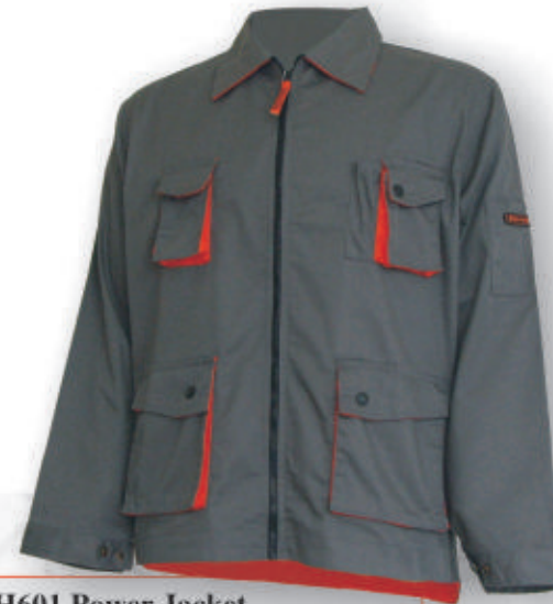
WH601 Power Jacket 65%polyester, 35% cotton fabric Brass button, PVC zippers High quality