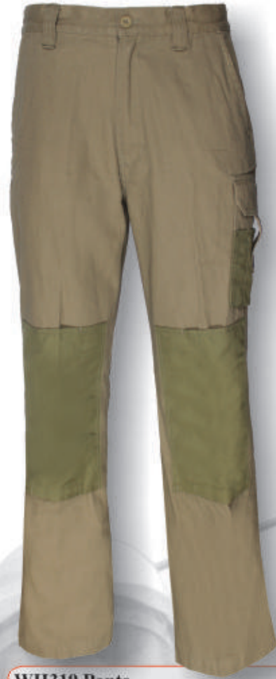
WH319 Pants 65%polyester, 35%cotton fabric 100%cotton Oxford fabric reinforcement High quality