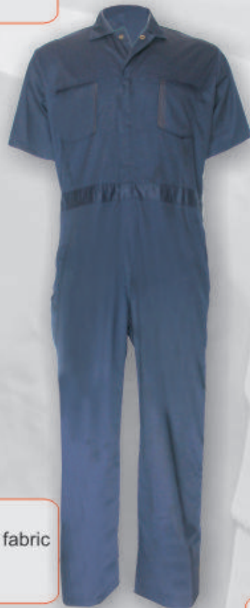
WH109 65%polyester, 35%cotton fabric 100%cotton Elastic waist Color combination