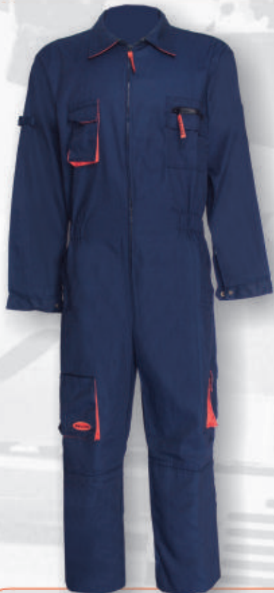
WH603 Power Coveralls blue 65%polyester, 35% cotton fabric Brass button, PVC zippers High quality