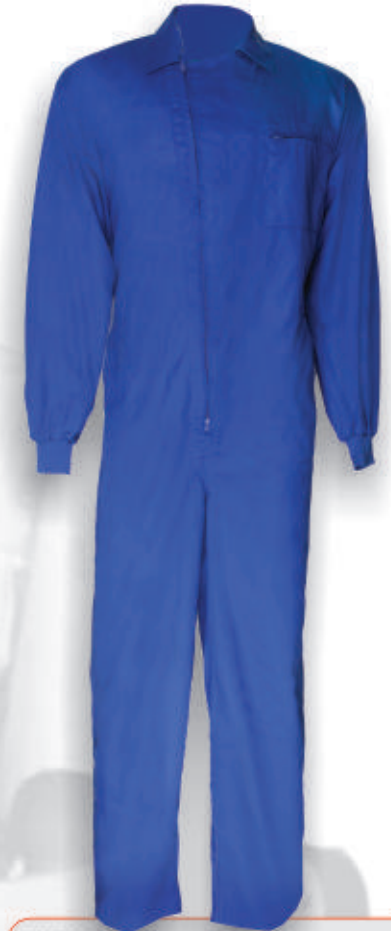
WH112 Coveralls 65%polyester, 35%cotton fabric Nylon zippers/ Knit wrist Elastic waist