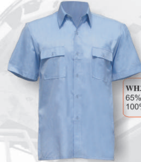
WH319 Shirt 65%polyester, 35%cotton fabric 100% cotton fabric