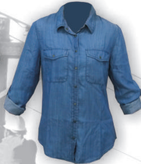
WH1009 Denim Shirt