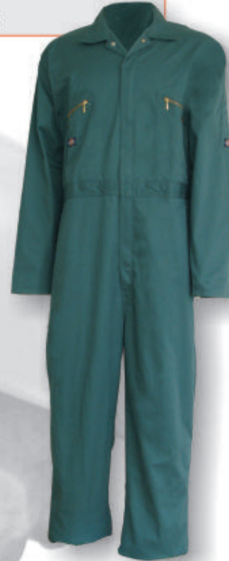
WH108 65%polyester, 35%cotton fabric 100%cotton Elastic waist Brass zippers