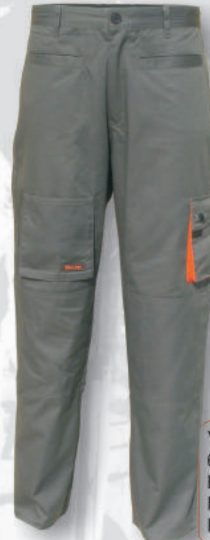
WH604 Power Pants 65%polyester, 35% cotton fabric Brass button, PVC zippers High quality Reinforced knee part