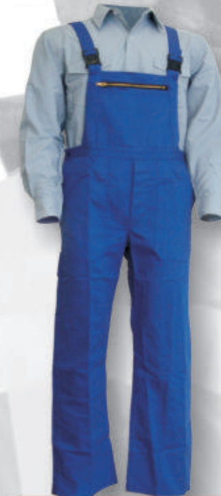
WH313 Bibpants 65%polyester, 35%cotton fabric 100% cotton Chest pocket with metal zipper