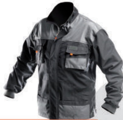
WH290A Jacket 65% polyester 35% cotton High quality