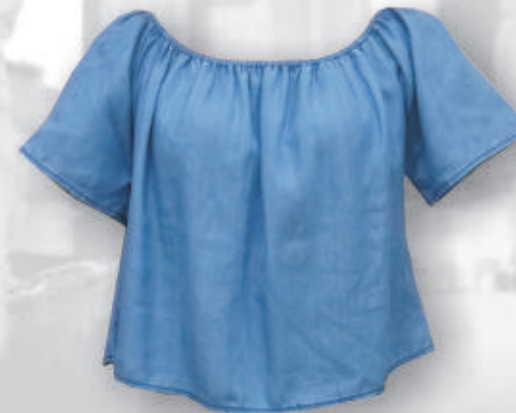
WH1024 Denim Shirt