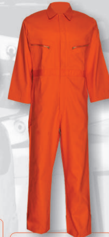
WH116 100%cotton proban fabric Fire resistance Brass zipper