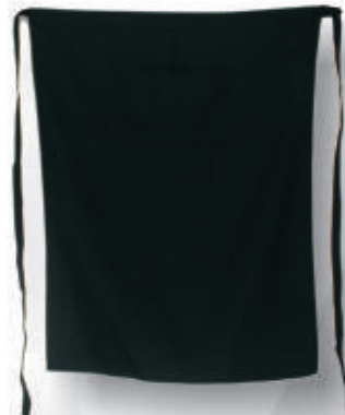
WH219 Long Apron 65%polyester, 35%cotton fabric