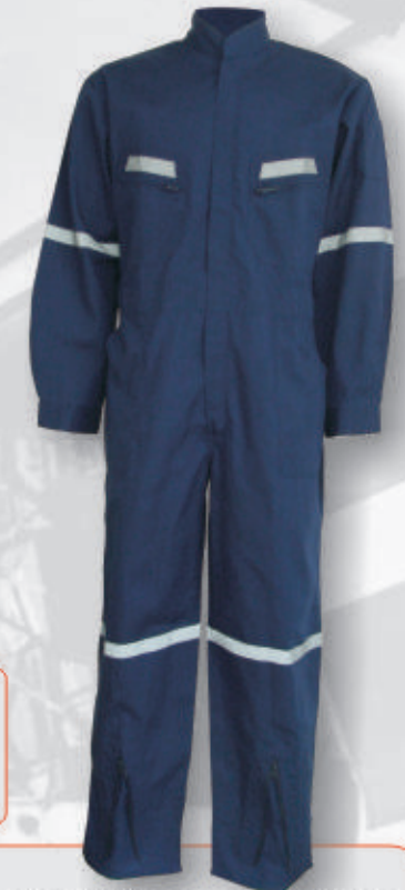
WH107 65%polyester,35%cotton poplin fabric Elastic waist, PVC zippers Reflective tape