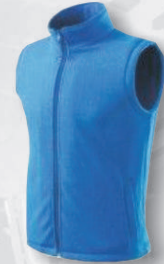
WH233 Polar Fleece Vest 100% polyester polar fleece