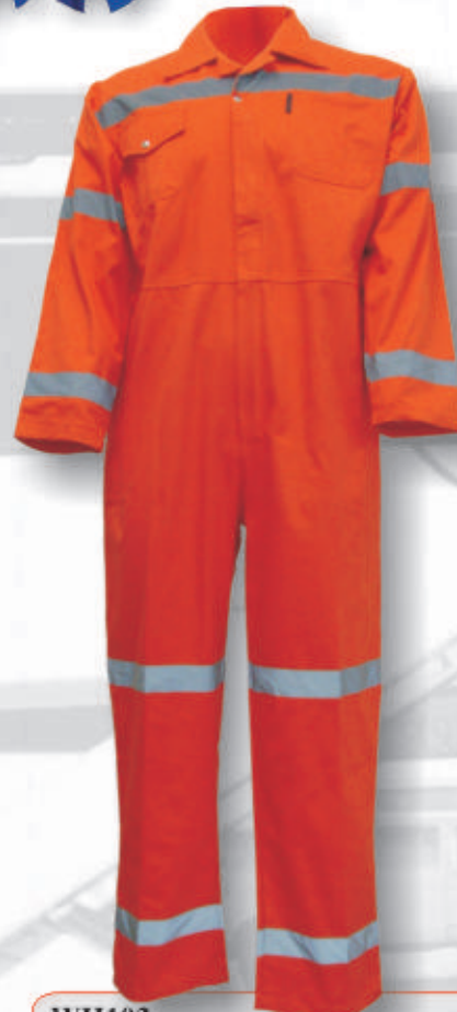
WH103 65%polyester, 35% cotton fabric 100% Cotton fabric Elastic waist with buckle Reflective tape