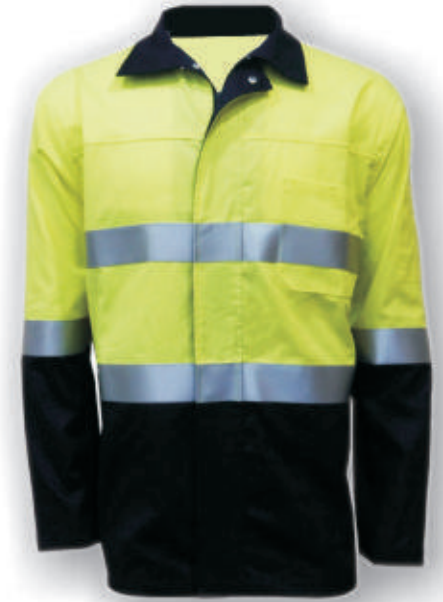
WH412 Shirt 100% cotton fabric 65%polyester, 35%cotton fabric Conforms to En471 class2