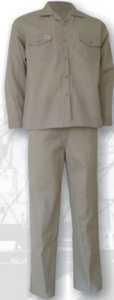
WH215 Shirt & Pants 65%polyester,35%cotton fabric 100% cotton fabric Two chest pockets with button Elastic waist