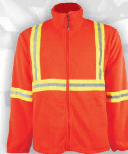
WH232 Polar Fleece Jacket 100% polyester polar fleece