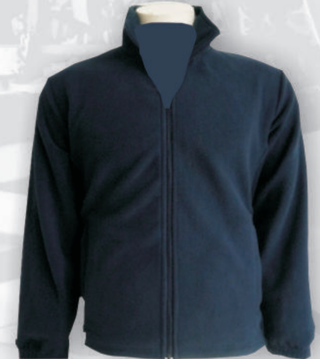
WH234 Polar Fleece Jacket 100% polyester polar fleece