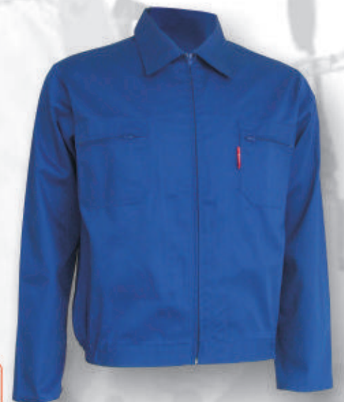
WH202 Jacket 65%polyester, 35%cotton fabric Elastic side waist Normal cuff