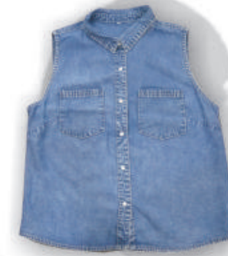
WH1021 Kids Denim