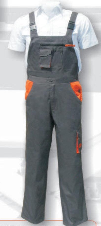
WH605 Power Bibpants 65%polyester, 35% cotton fabric Brass button, PVC zippers High quality