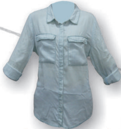
WH1010 Denim Shirt