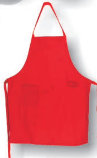
WH218 Full Apron 65%polyester, 35%cotton fabric