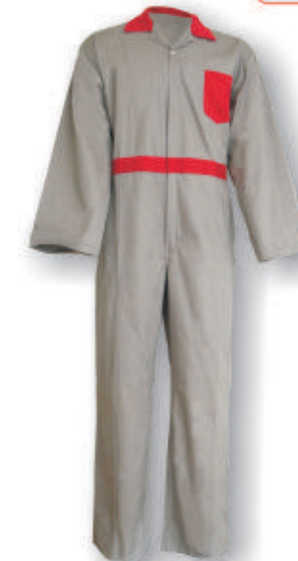
WH209 Coveralls 100%cotton fabric Color combination