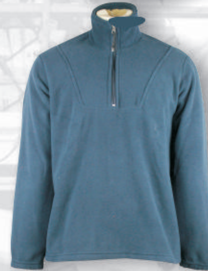
WH231 Polar Fleece Jacket short zipper 100% polyester polar fleece