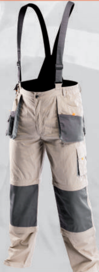
WH290B Bibpants 100% cotton High quality