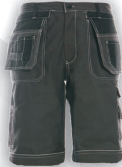
WH207 Shorts 65%polyester, 35% cotton fabric Color combination Brass button & zipper