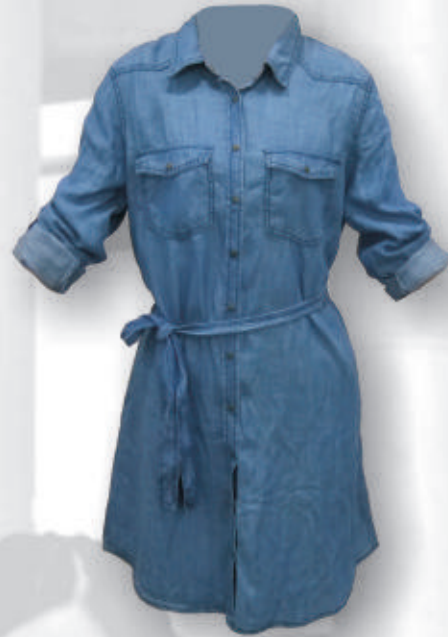
WH1014 Denim Long Coat