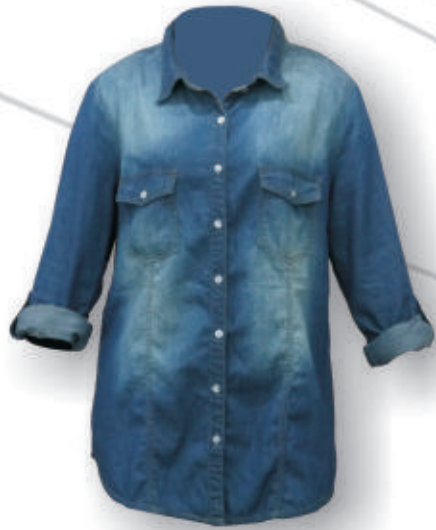
WH1007 Denim Shirt