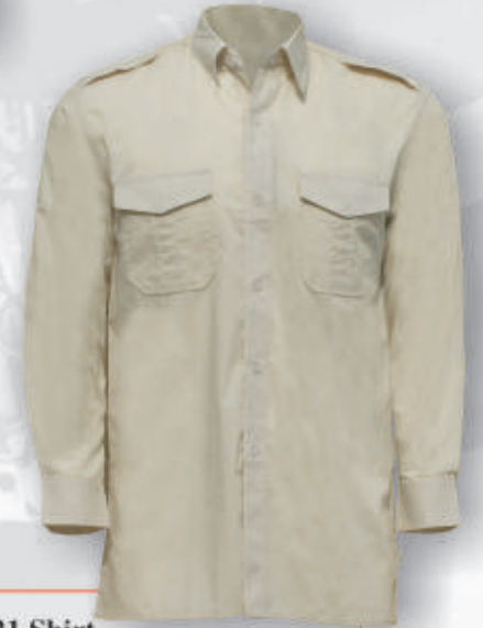
WH321 Shirt 65%polyester, 35%cotton fabric 100% cotton fabric