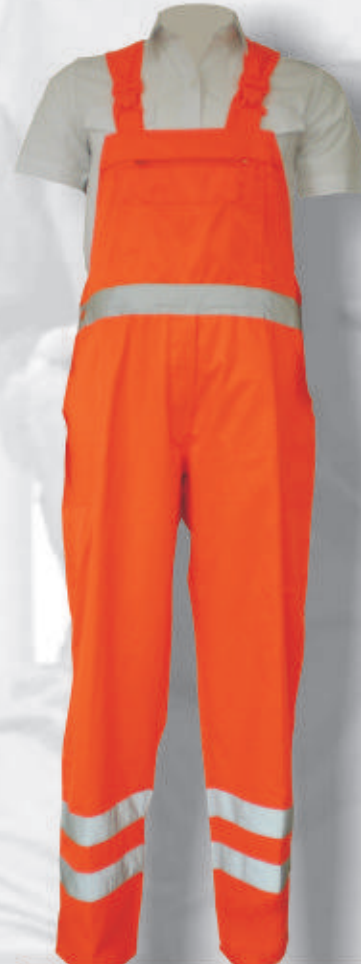
WH210 Bibpants 100% Cotton fabric 65%polyester, 35%cotton fabric Chest pocket with zipper