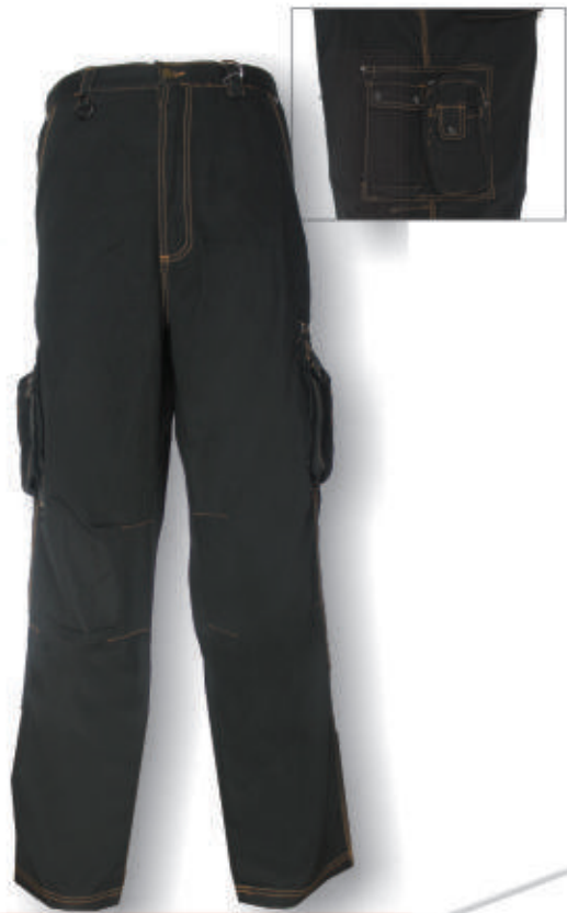
WH207A Pants 65%polyester, 35%cotton fabric Brass zipper & buttons