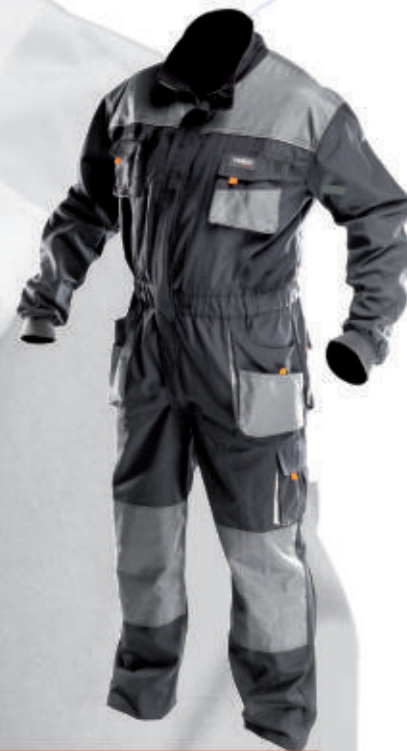
WH290 Coverall 65% polyester 35% cotton High quality