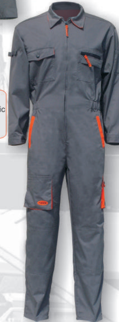
WH603 Power Coveralls 65%polyester, 35% cotton fabric Brass button, PVC zippers High quality