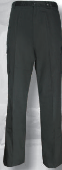
WH316 Pants 65%polyester, 35%cotton fabric 100%cotton Two side pockets with velcro Side cargo pockets