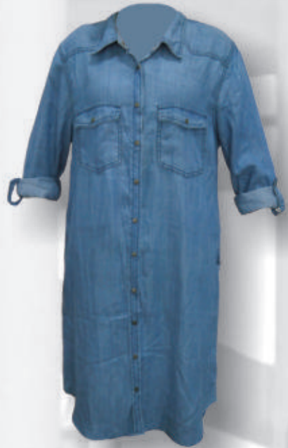
WH1013 Denim Long Coat