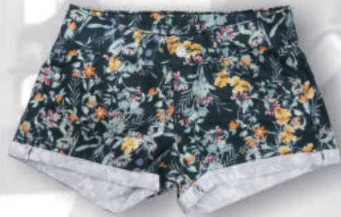
WH1016 Denim Shorts