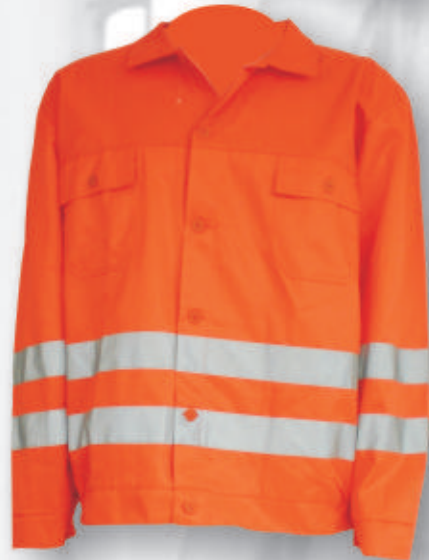
WH260 Jacket HIVI Jacket Color:fluo orange, fluo yellow Reflective tape