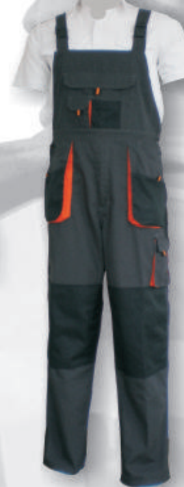
WH280 Emerton Bibpants 65%polyester, 35% cotton canvas Oxford fabric reinforcement High quality