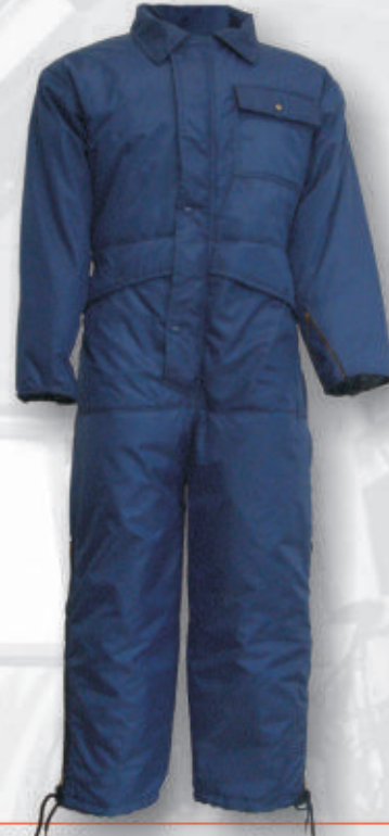
WH507 Winter Coveralls Shell: 100% nylon with PVC coating Lining:100% nylon Padding:100% polyester