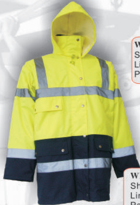
WH504 Winter Parka Shell: 100%nylon Lining: 100%polyester Padding: 100% polyester