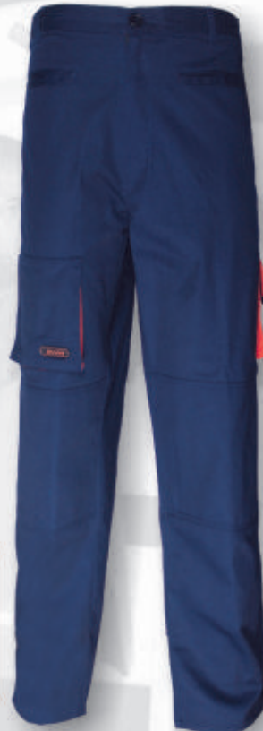
WH604 Power Pants blue 65%polyester, 35% cotton fabric Brass button, PVC zippers High quality Reinforced knee part