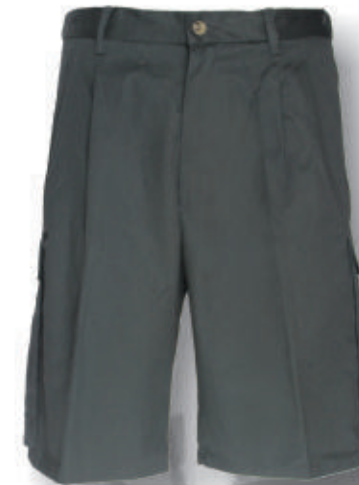
WH322 Shorts 65%polyester, 35%cotton fabric 100%cotton Side cargo pockets