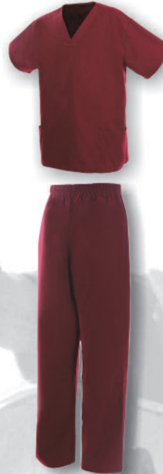
WH701 Scrubs 65%polyester, 35%cotton fabric Elastic waist pants Leg pockets