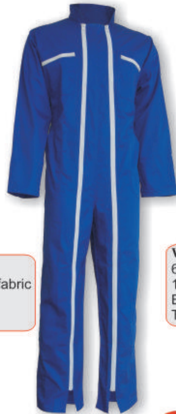
WH112 65%polyester,35%cotton fabric Elastic waist Two long PVC zippers