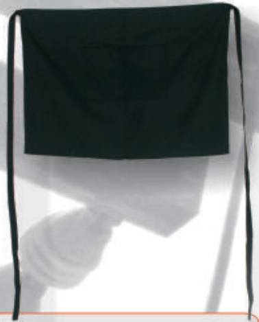
WH217 Short Apron 65%polyester, 35%cotton fabric