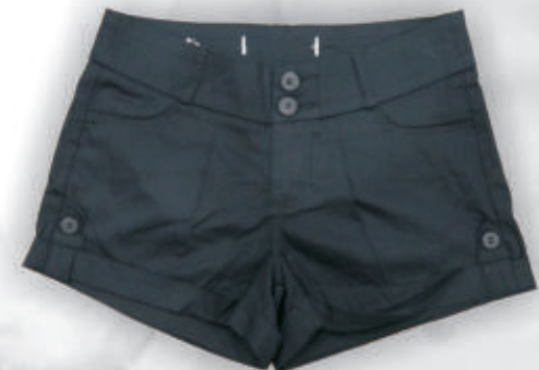
WH1018 Denim Shorts