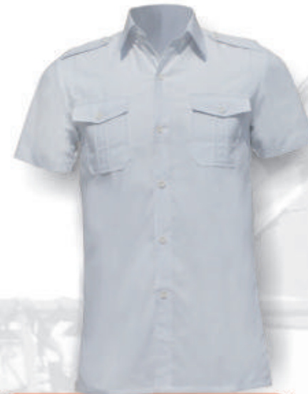
WH318 Shirt 65%polyester, 35%cotton fabric Two chest pockets and epaulet