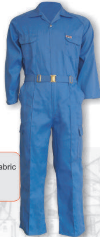
WH102 65%polyester, 35% cotton fabric 100% Cotton fabric Elastic waist with buckle Two leg pockets