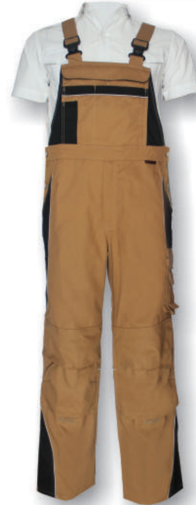
WH314 Bibpants 65%polyester, 35%cotton fabric Oxford fabric reinforcement Color combination

Wuxue Kinglong Safety Products Co., Ltd.