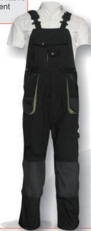
WH615 Bibpants 65%polyester, 35%cotton fabric Brass button Oxford fabric reinforcement