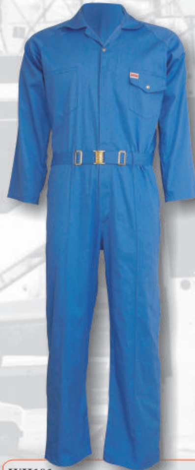
WH101 65%polyester, 35% cotton fabric 100% Cotton fabric Elastic waist with buckle