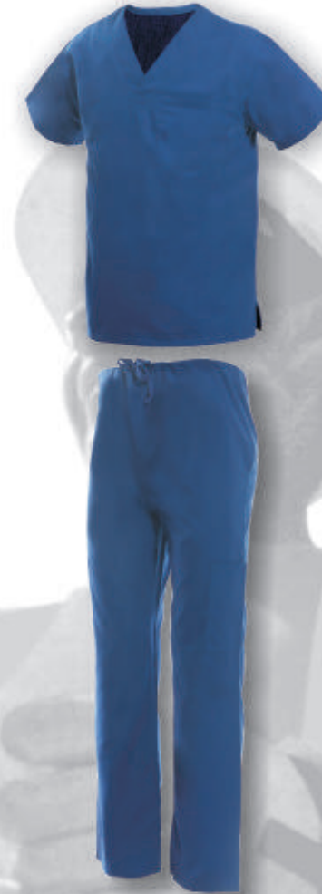
WH702 Scrubs 65%polyester, 35%cotton fabric Elastic waist pants Leg pockets