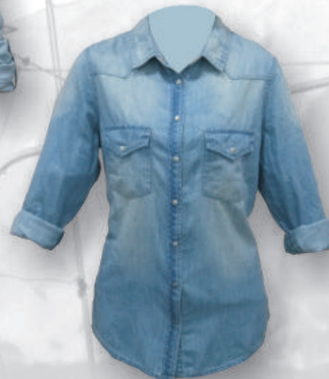
WH1012 Denim Shirt