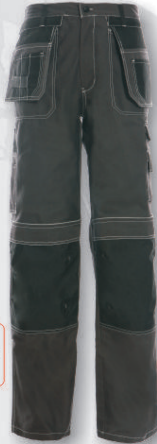
WH207 Trousers 65%polyester, 35% cotton fabric Detachable Pocket Brass button & zipper