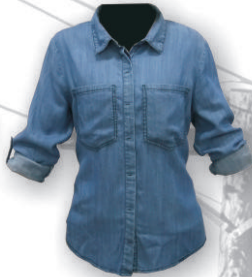
WH1008 Denim Shirt