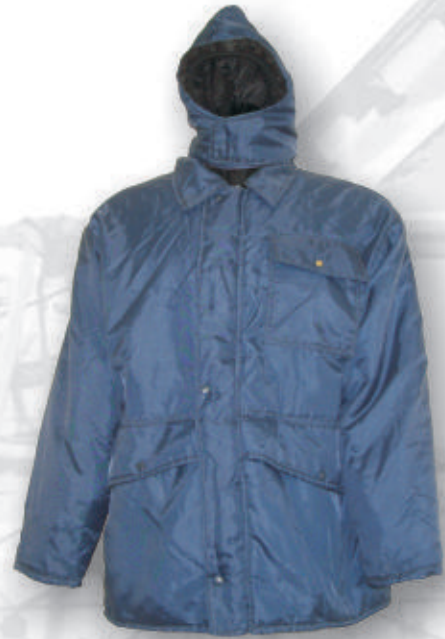
WH508 Winter Parka Shell: 100% tason nylon Lining:100% nylon Padding:100% polyester