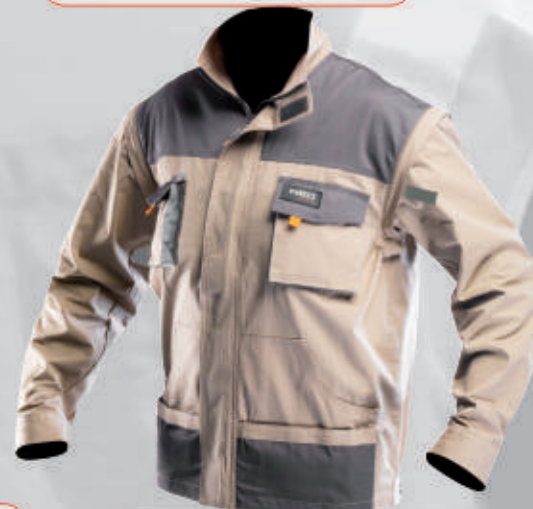
WH290B Jacket 100% cotton High quality