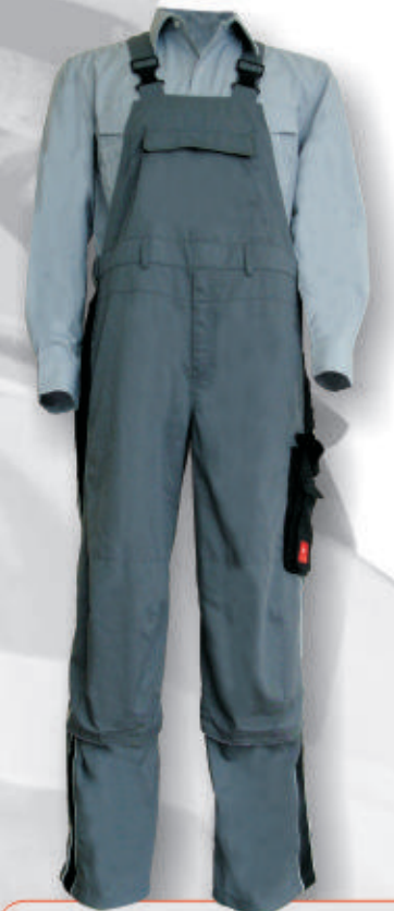
WH311 Bibpants 65%polyester, 35%cotton fabric Side pockets Color combination