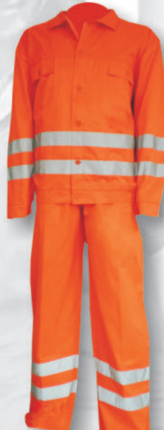
WH260 Suits HIVI Suits Color:fluo orange, fluo yellow Reflective tape