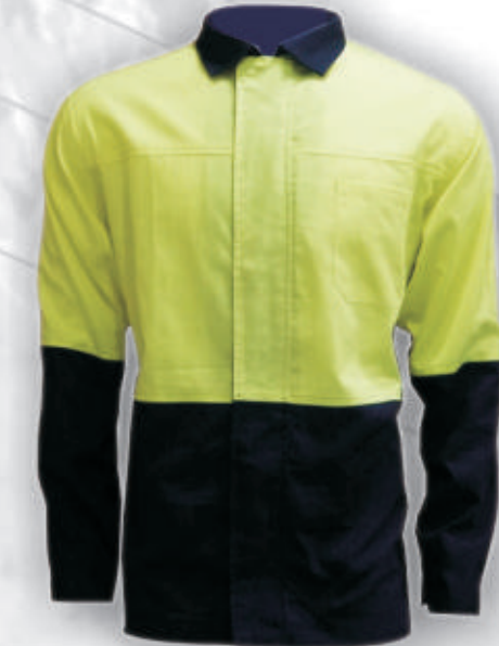
WH414 Shirt 100% cotton fabric 65%polyester, 35%cotton fabric