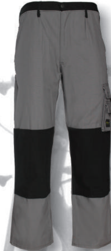
WH317 Chef Coat & Pants 65%polyester, 35%cotton fabric 100%cotton Pockets with velcro