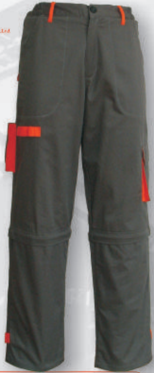
WH606 Power Pants 65%polyester, 35% cotton fabric Brass button, PVC zippers High quality With zipper on knee part