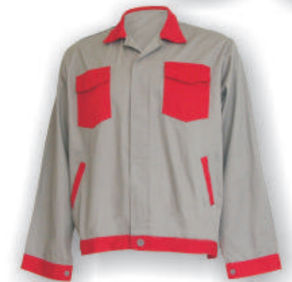
WH209 Jacket 100%cotton fabric Color combination