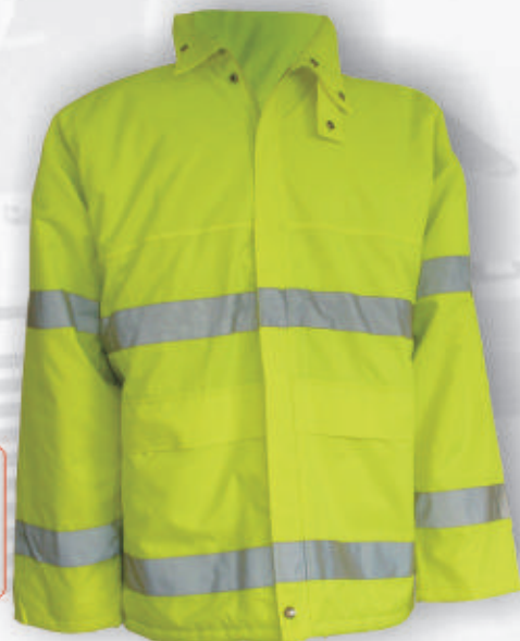
WH505 Winter Jacket Shell: 100%nylon Lining: 100%polyester Padding: 100% polyester