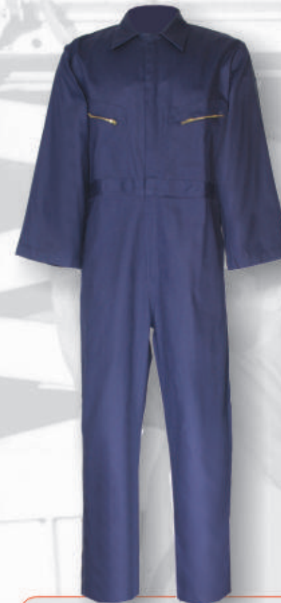
WH115 100%cotton proban fabric Fire resistance Brass zipper