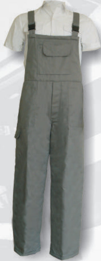
WH503 Padded Bibpants Shell: 65%polyester, 35%cotton Water resistance fabric Lining:100% nylon Padding:100% polyester