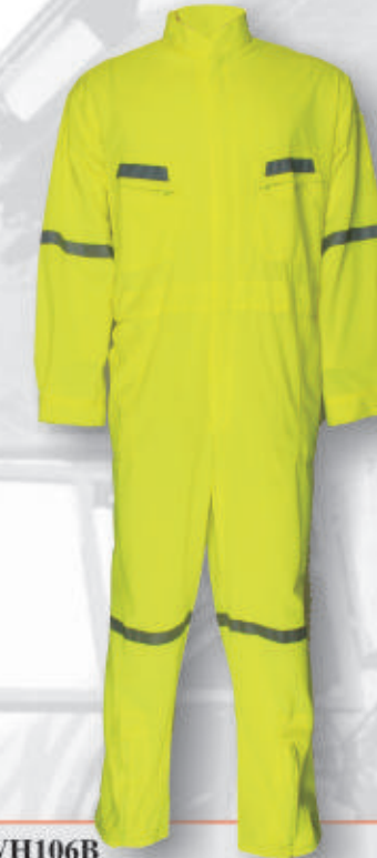
WH106B 100%polyester fluorescent Elastic waist, PVC zippers Reflective tape