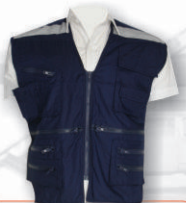
WH409 Vest blue 65%polyester, 35%cotton fabric PVC zipper Reflective tape