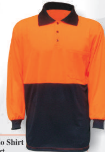
WH407 Polo Shirt Knitted Shirt Conforms to En471 standard Color: fluorescent orange or yellow