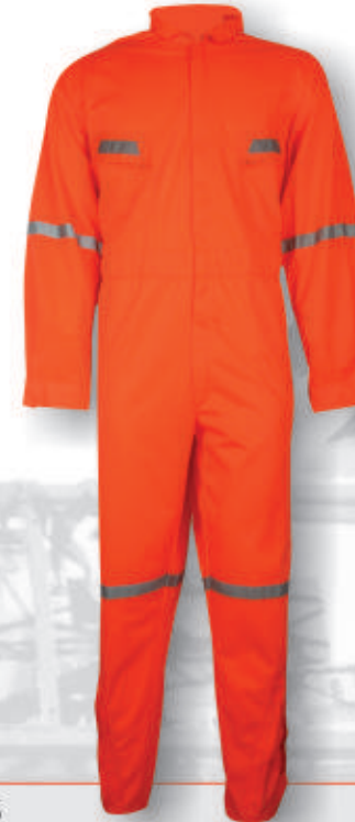
WH106 65%polyester 35%cotton canvas fabric Elastic waist, PVC zippers Reflective tape