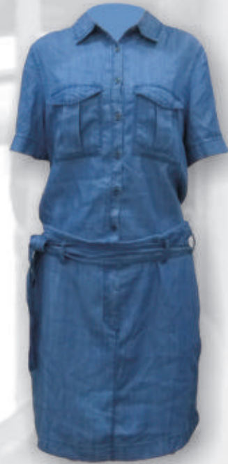
WH1015 Denim Long Coat