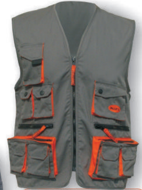
WH602 Power Vest 65%polyester, 35% cotton fabric Brass button, PVC zippers High quality