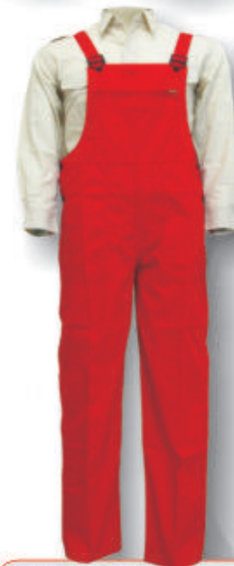
WH312 Bibpants 65%polyester, 35%cotton fabric 100% cotton Chest pocket with nylon zipper