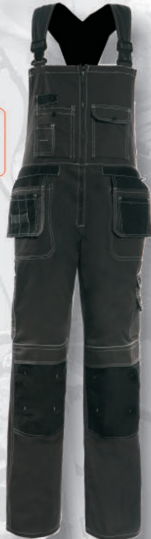
WH207 Bibpants 65%polyester, 35% cotton fabric Detachable Pocket Brass button & zipper