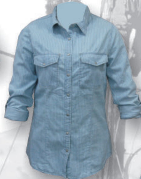
WH1011 Denim Shirt