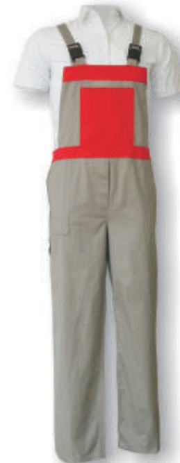
Wh209 Bibpants 100%cotton fabric Color combination