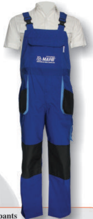
WH316 Bibpants 65%polyester, 35%cotton canvas fabric Brass button Oxford fabric reinforcement