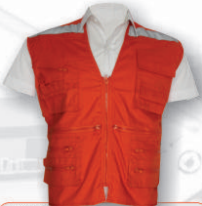
WH409 Vest red 65%polyester, 35%cotton fabric PVC zipper Reflective tape