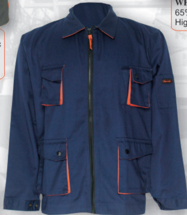
WH601 Power Jacket blue 65%polyester, 35% cotton fabric Brass button, PVC zippers High quality