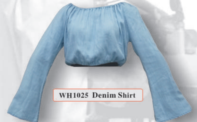
WH1025 Denim Shirt