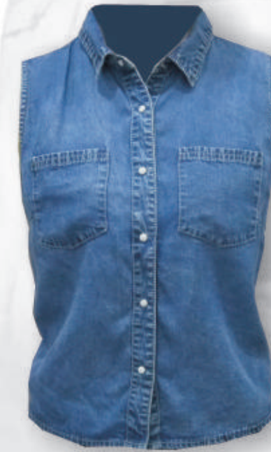
WH1023 Denim vest