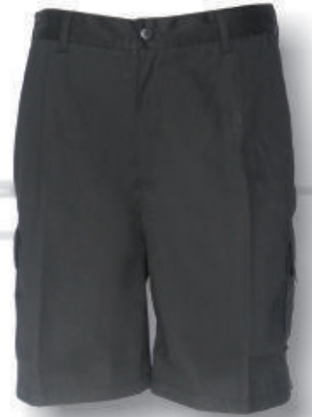
WH321 Shorts 65%polyester, 35%cotton fabric 100%cotton Side cargo pockets