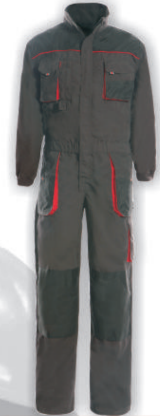
WH280 Emerton Pants 65%polyester, 35% cotton canvas Oxford fabric reinforcement High quality