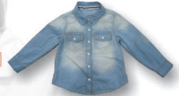
WH1022 Kids Denim