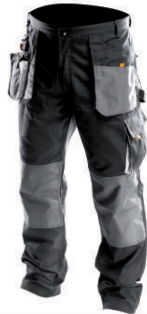
WH 290 Pants 65% polyester 35% cotton High quality