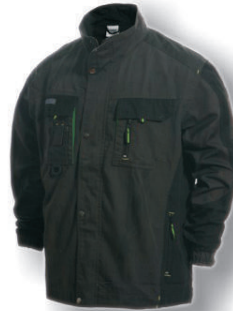
WH611 Jacket 65%polyester, 35% cotton fabric Brass button, nylon zipper Color combination