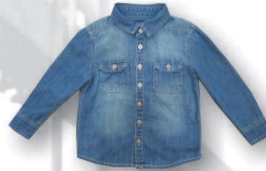
WH1020 Kids Denim