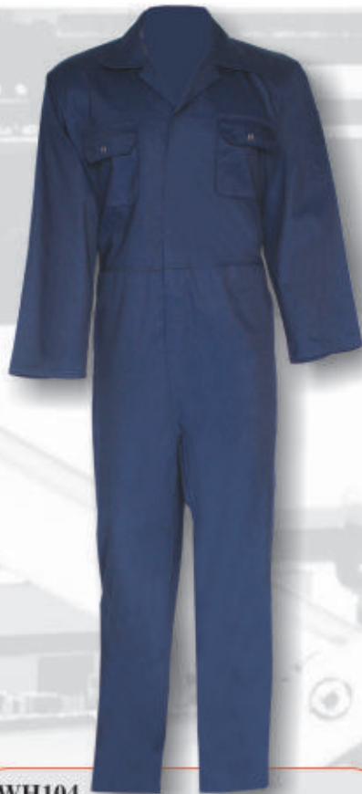
WH104 65%polyester, 35% cotton fabric 100% Cotton fabric Elastic waist without buckle