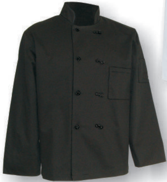
WH203 Chef Coat 65%polyester, 35%cotton fabric Knots