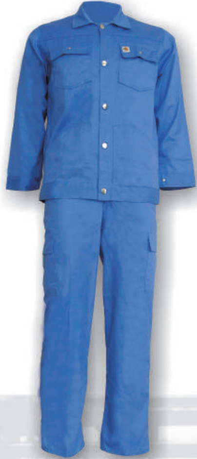
WH213 Jacket & Pants 65%polyester,35%cotton fabric 100% cotton fabric Metal buttons Elastic waist Two side leg pockets