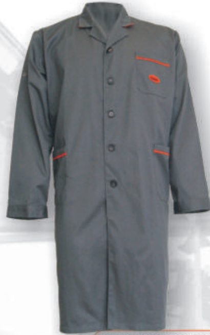
WH607 Power Long Coat 65%polyester, 35% cotton fabric High quality