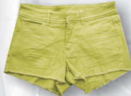
WH1017 Denim Shorts