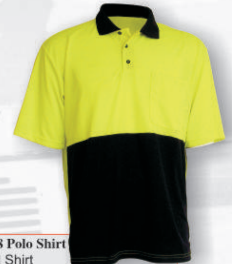
WH408 Polo Shirt Knitted Shirt Conforms to En471 standard Color: fluorescent orange or yellow