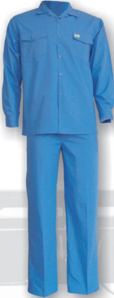
WH215 Shirt & Pants 65%polyester,35%cotton fabric 100% cotton fabric Two chest pockets with button Elastic waist