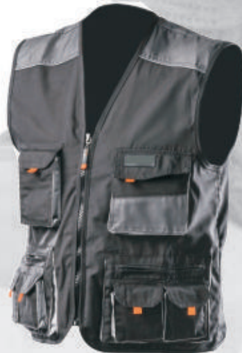
WH290 Vest 65% polyester 35% cotton High quality