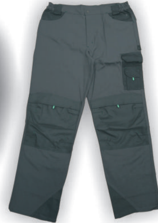
WH614 Pants 65%polyester, 35% cotton fabric Brass button, PVC zippers Color combination