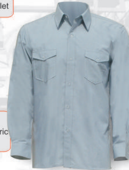
WH320 Shirt 65%polyester, 35%cotton fabric 100% cotton fabric