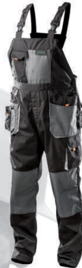
WH290A Bibpants 65% polyester 35% cotton High quality