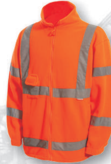
WH230 Polar Fleece Jacket 100% polyester polar fleece