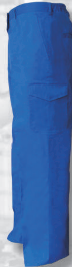
WH201 Pants 65%polyester, 35%cotton fabric Elastic waist Two leg pockets