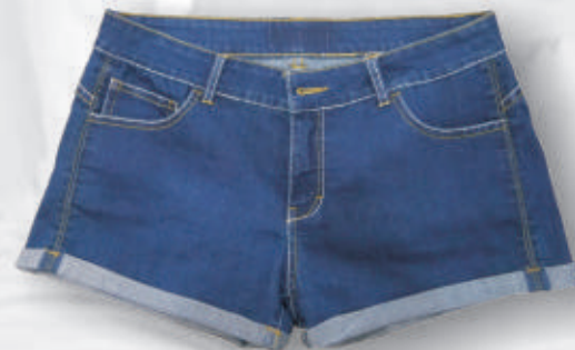
WH1019 Denim Shorts