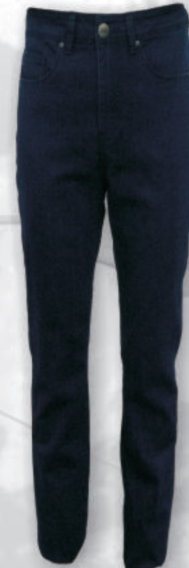
WH1005 Jeans 100% cotton 60% cotton,40%polyester