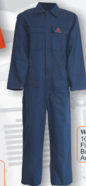
WH110 100%cotton Proban fabric Fire resistance Buttons Anti static