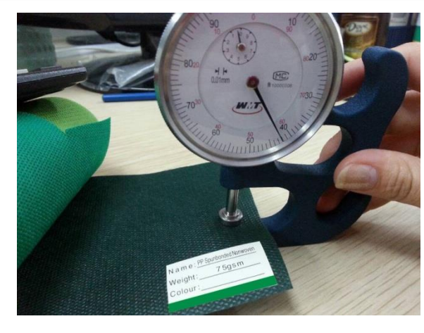
>> Thickness Test