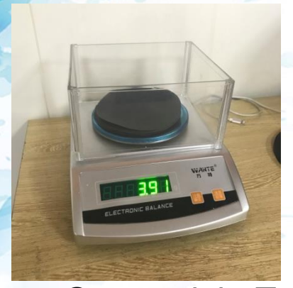
>> Gramweight Test