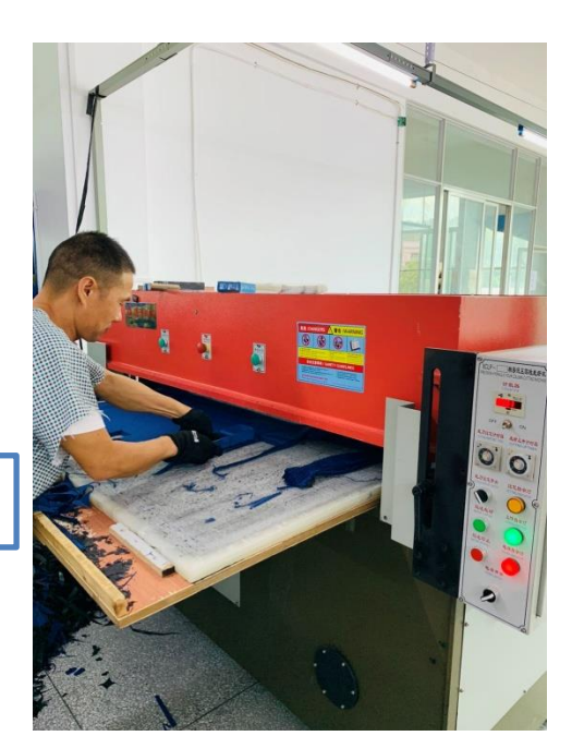
Materials Cutting Machine