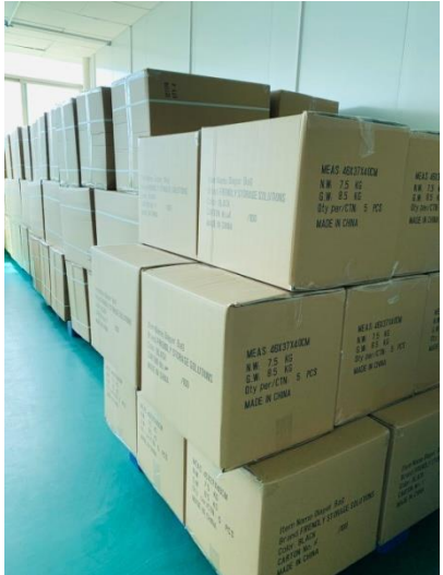
Package and master carton