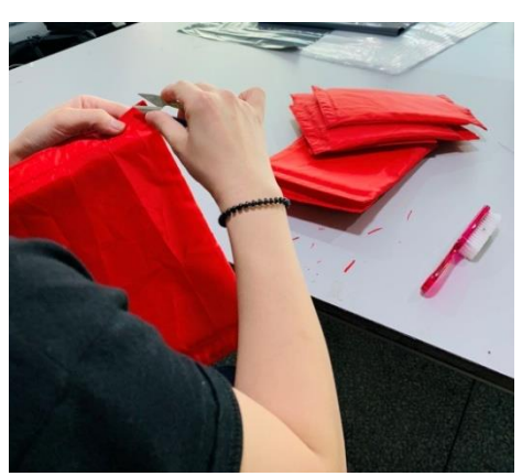
Inspection in house piece by piece