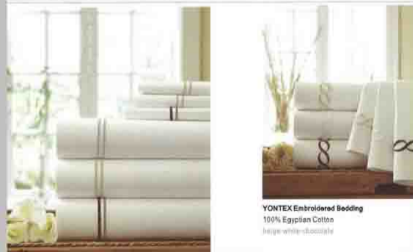
YONTEX Embroidered Bedding 100% Egyptian Cotton large white - classic