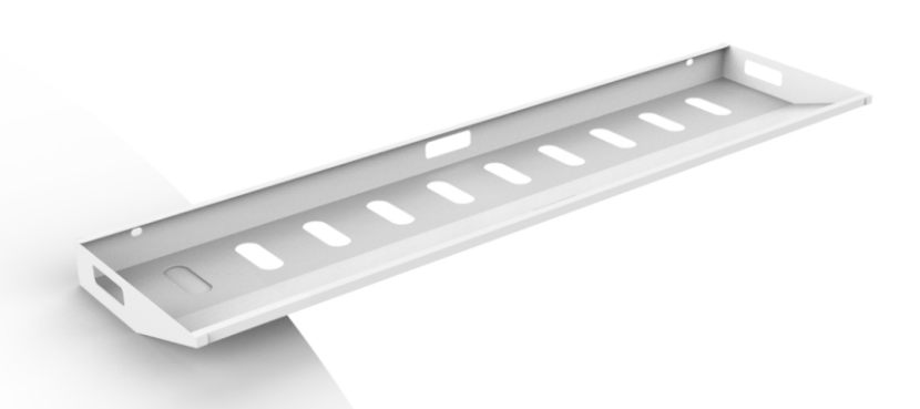
Large Cable Tray