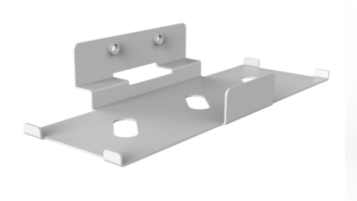
Mini Cable Tray