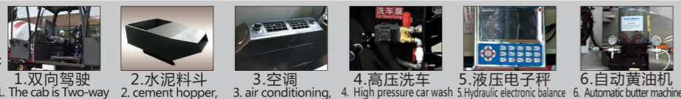
1. 双向驾驶 2. 水泥料斗 3. 空调 4. 高压洗车 5. 液压电子秤 6. 自动黄油机 1. The cab is Two-way 2. cement hopper, 3. air conditioning, 4. High pressure car wash 5. Hydraulic electronic balance 6. Automatic butter machine