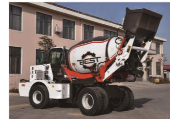
车型可选： 驾驶室左前方 与动臂滚筒同时左右旋转， 驾驶室左后方 可前后双向驾驶 The vehicle can be selected: the cab is in the front-left : the moving arm drum and the cab can be rotated at the same time the cab is in the left rear : the mixer can drive bi-directionally.

At this point, the 5th generation of products truly realizes the multi-purpose function of loading, stirring, transportation, car washing, etc.