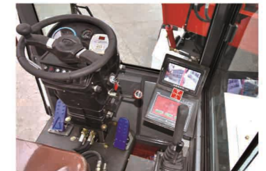
先导操纵 灵活方便， 触摸屏定量加水 使搅拌更均匀，更符合标准 The pilot manipulation is flexible and convenient, and the touch screen can add water to make the mixing more uniform and more consistent with the standard.

The cab operating table can be rotated, and the mixer can drive bi-directionally. It is more convenient.