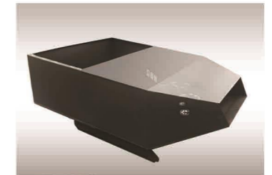
水泥料斗 ，利用水泥料斗减少上水泥时间 Cement hopper, using cement hopper to reduce cement time.