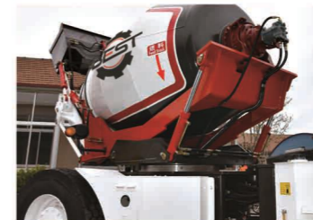
可前倾式卸料 功能 使卸料更彻底，速度更快 The dumping function can make the unloading more thorough and faster.