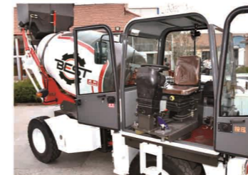
驾驶室操作台可旋转 ，前后双向驾驶更方便 The cab operating table can be rotated, and the mixer can drive bi-directionally. It is more convenient.